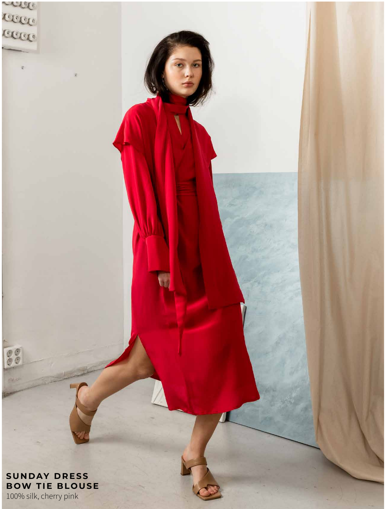
SUNDAY DRESS BOW TIE BLOUSE 100% silk, cherry pink