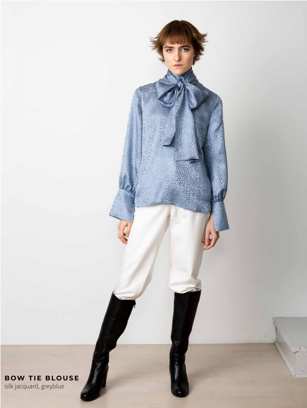
BOW TIE BLOUSE silk jacquard, greyblue