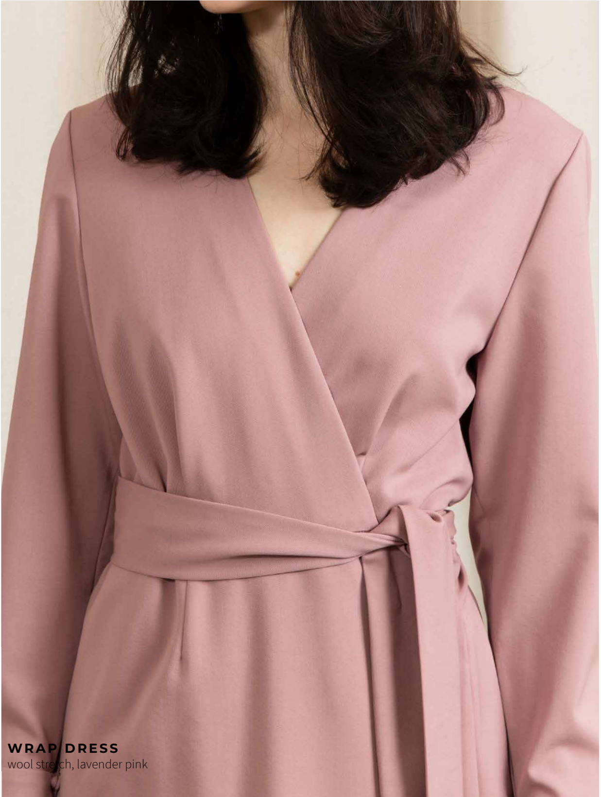
WRAP DRESS wool stretch, lavender pink