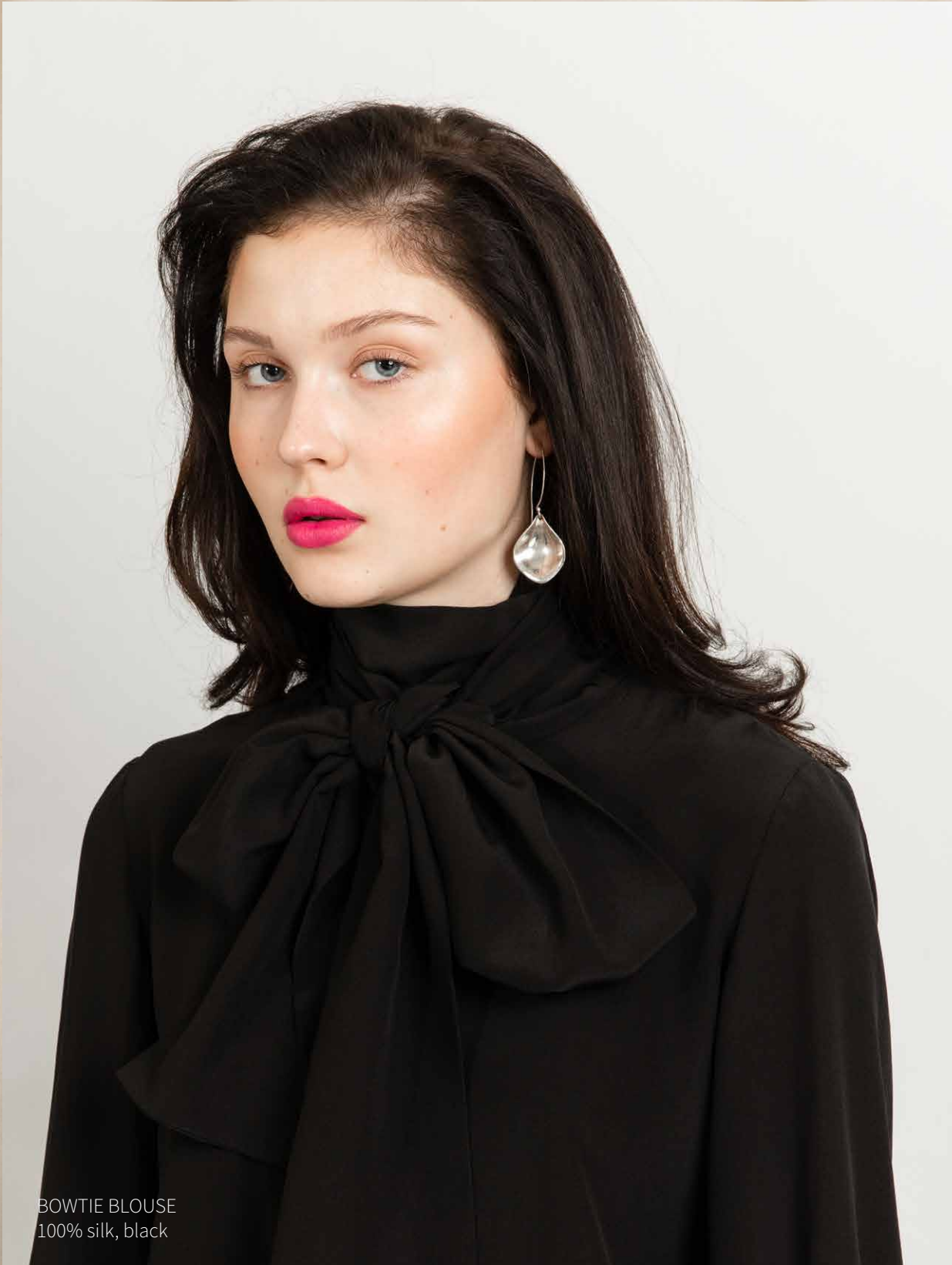
BOWTIE BLOUSE 100% silk, black