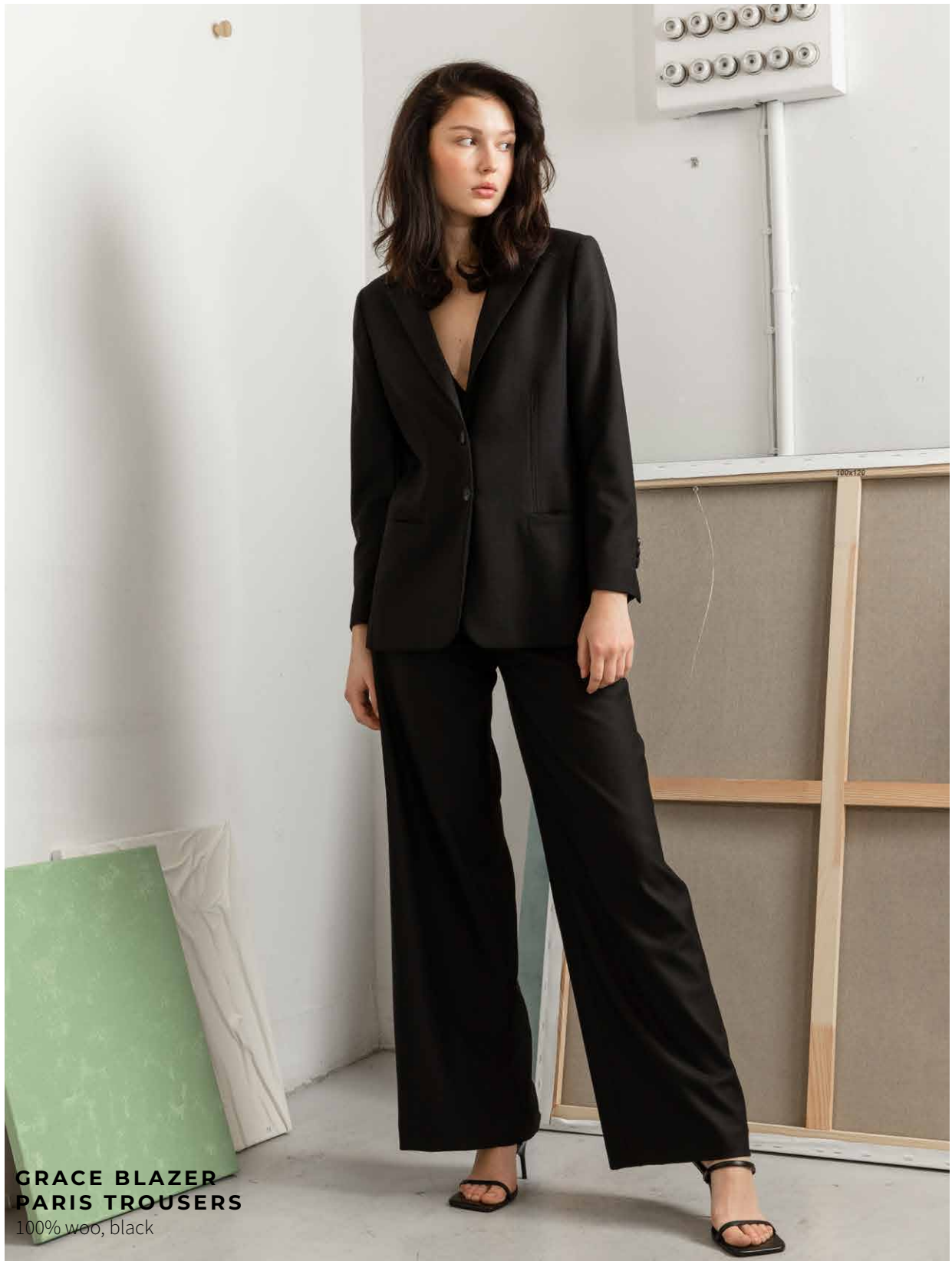
GRACE BLAZER PARIS TROUSERS 100% wool, black