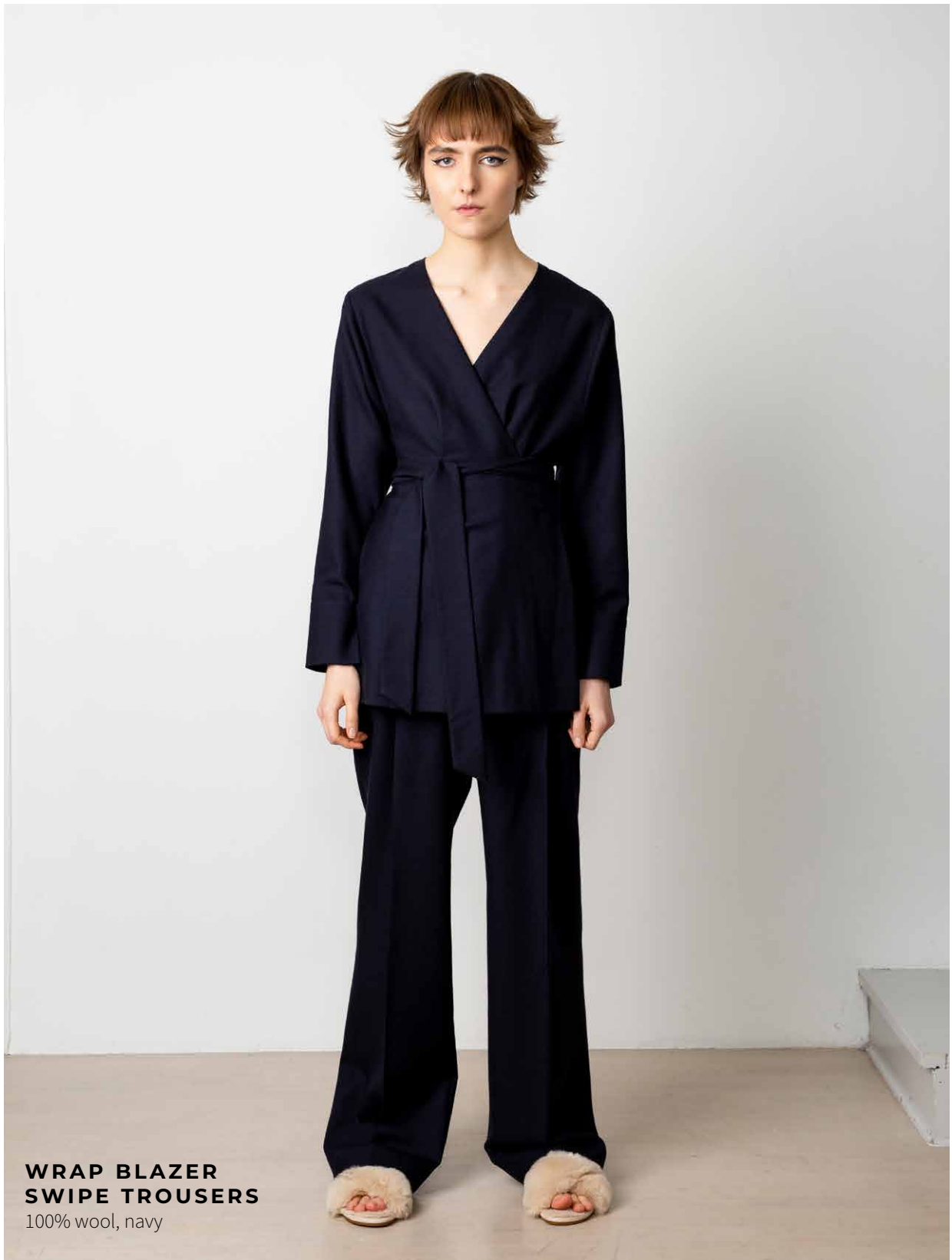
WRAP BLAZER SWIPE TROUSERS 100% wool, navy