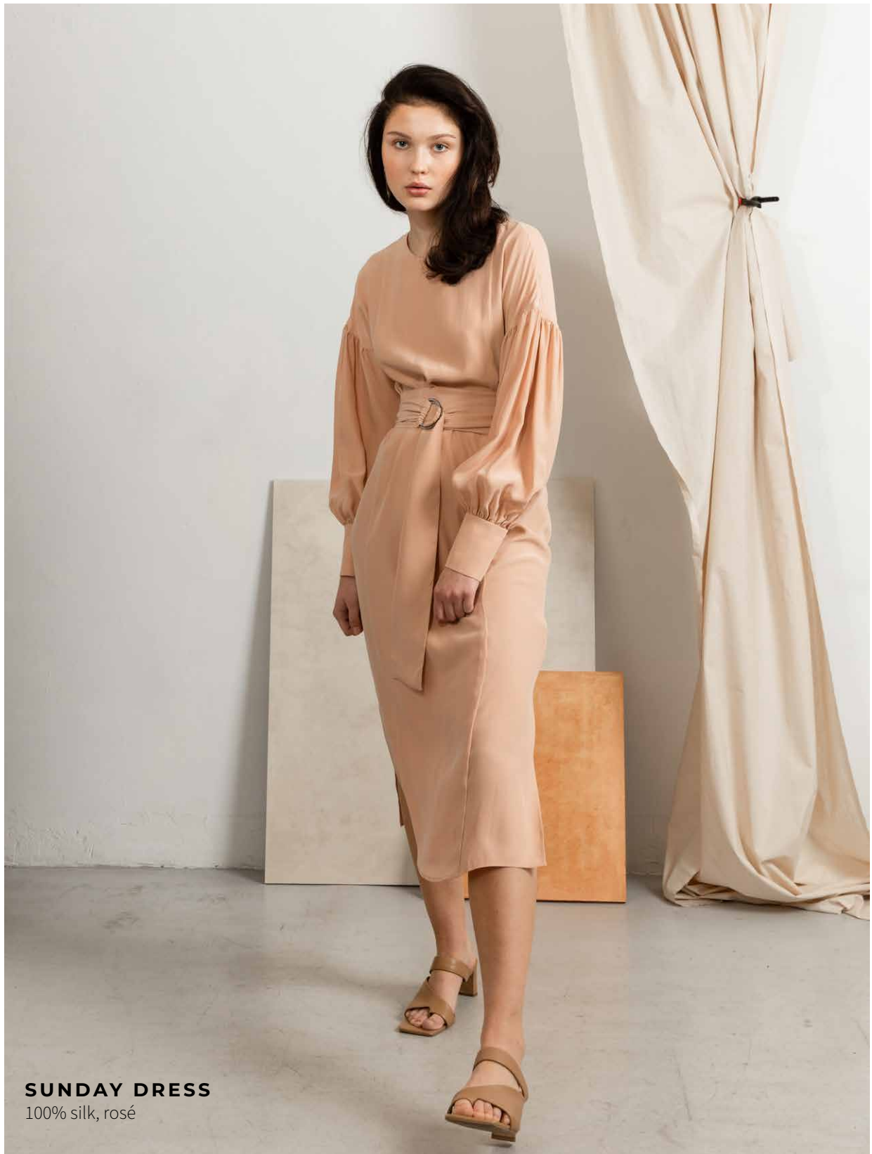
SUNDAY DRESS 100% silk, rosé