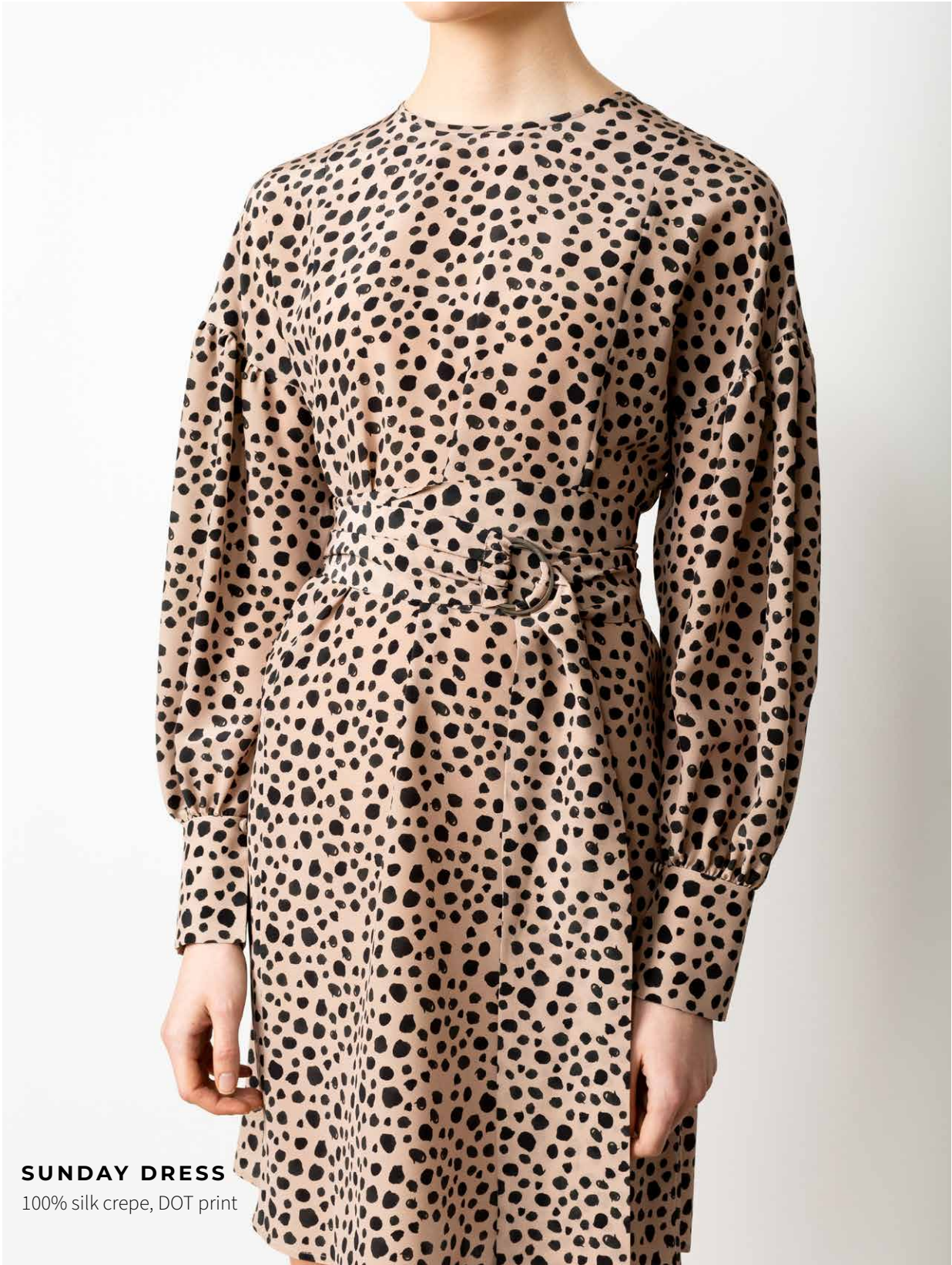
SUNDAY DRESS 100% silk crepe, DOT print