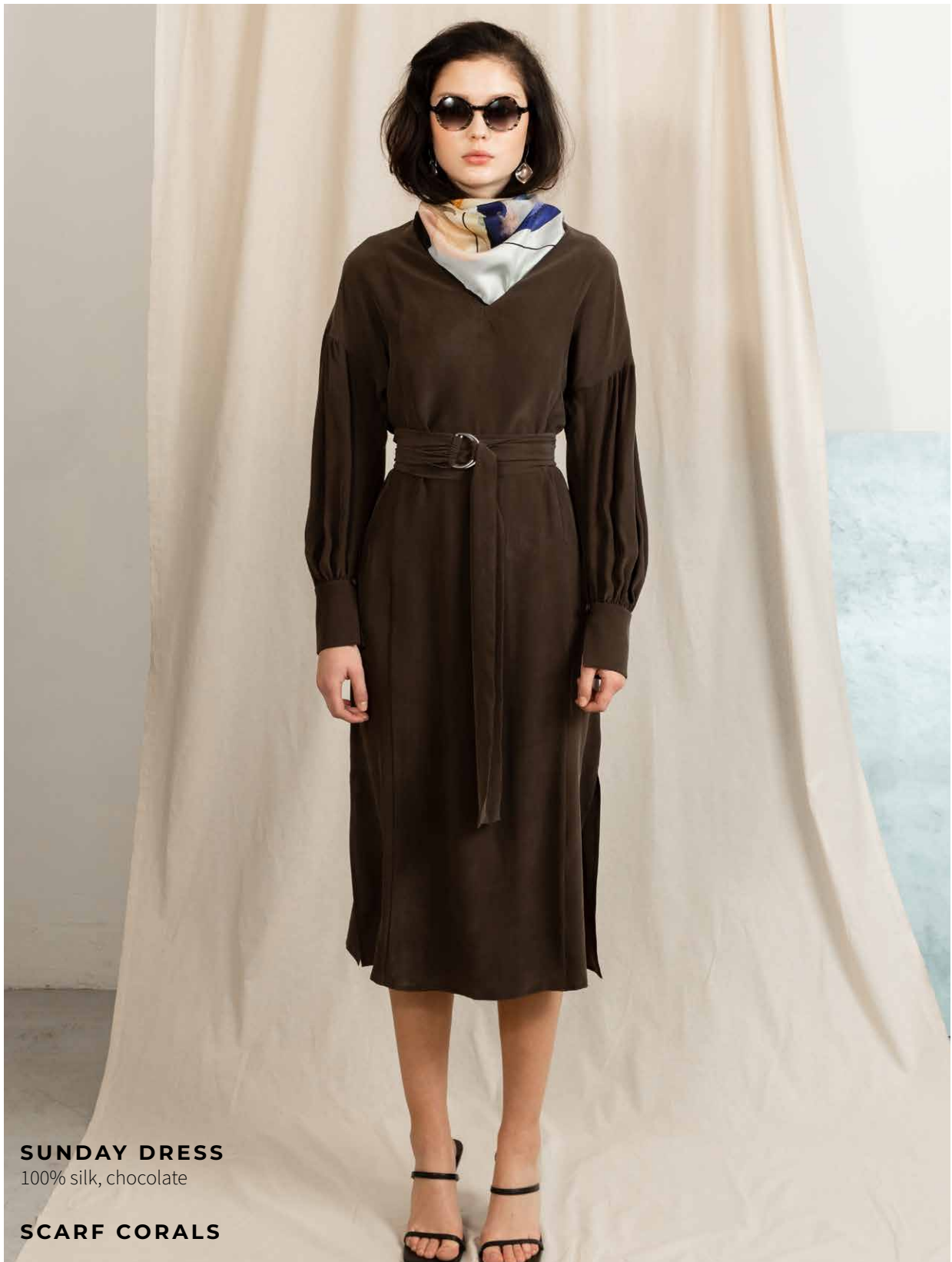
SUNDAY DRESS 100% silk, chocolate