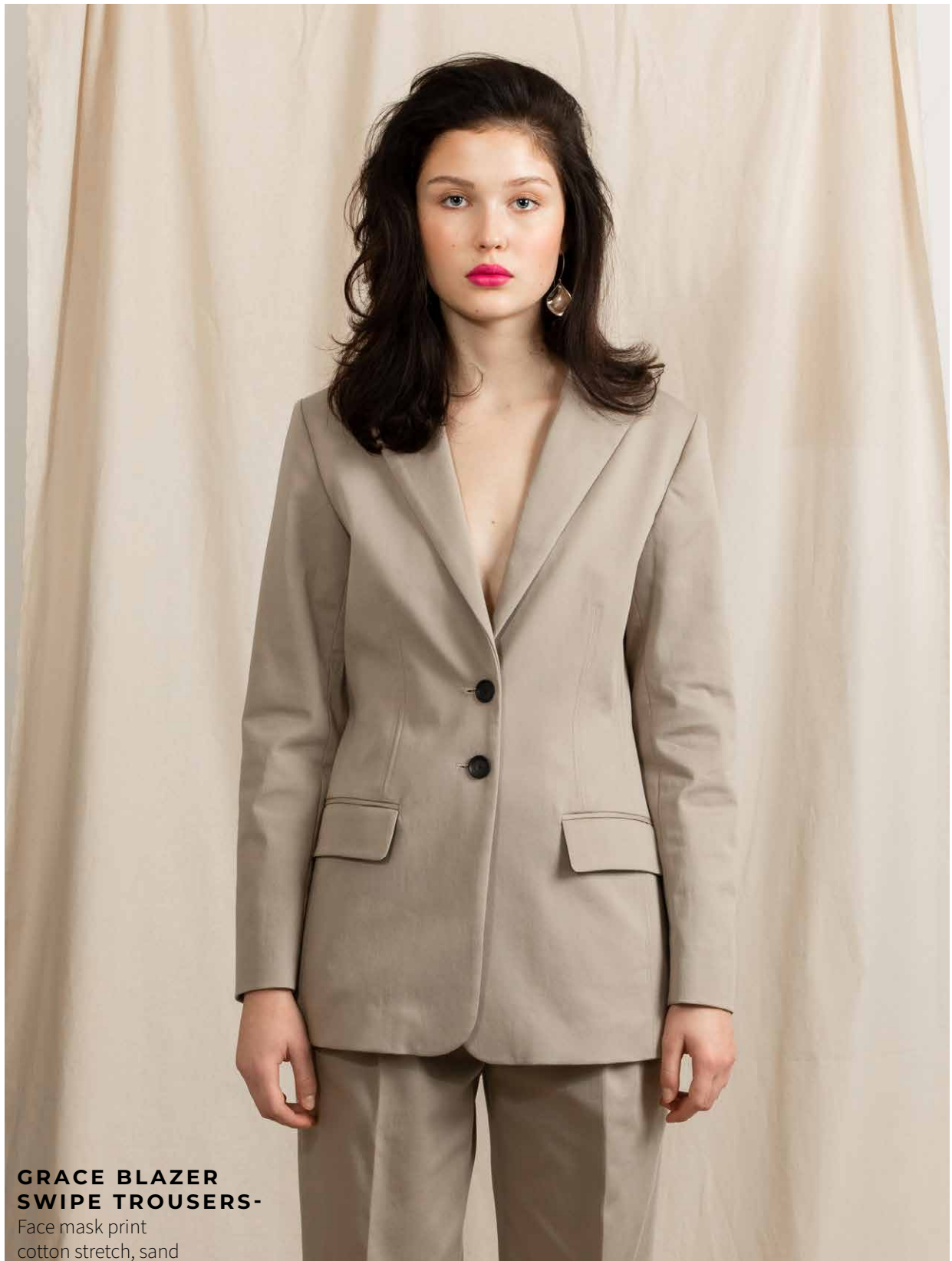
GRACE BLAZER SWIPE TROUSERS- Face mask print cotton stretch, sand