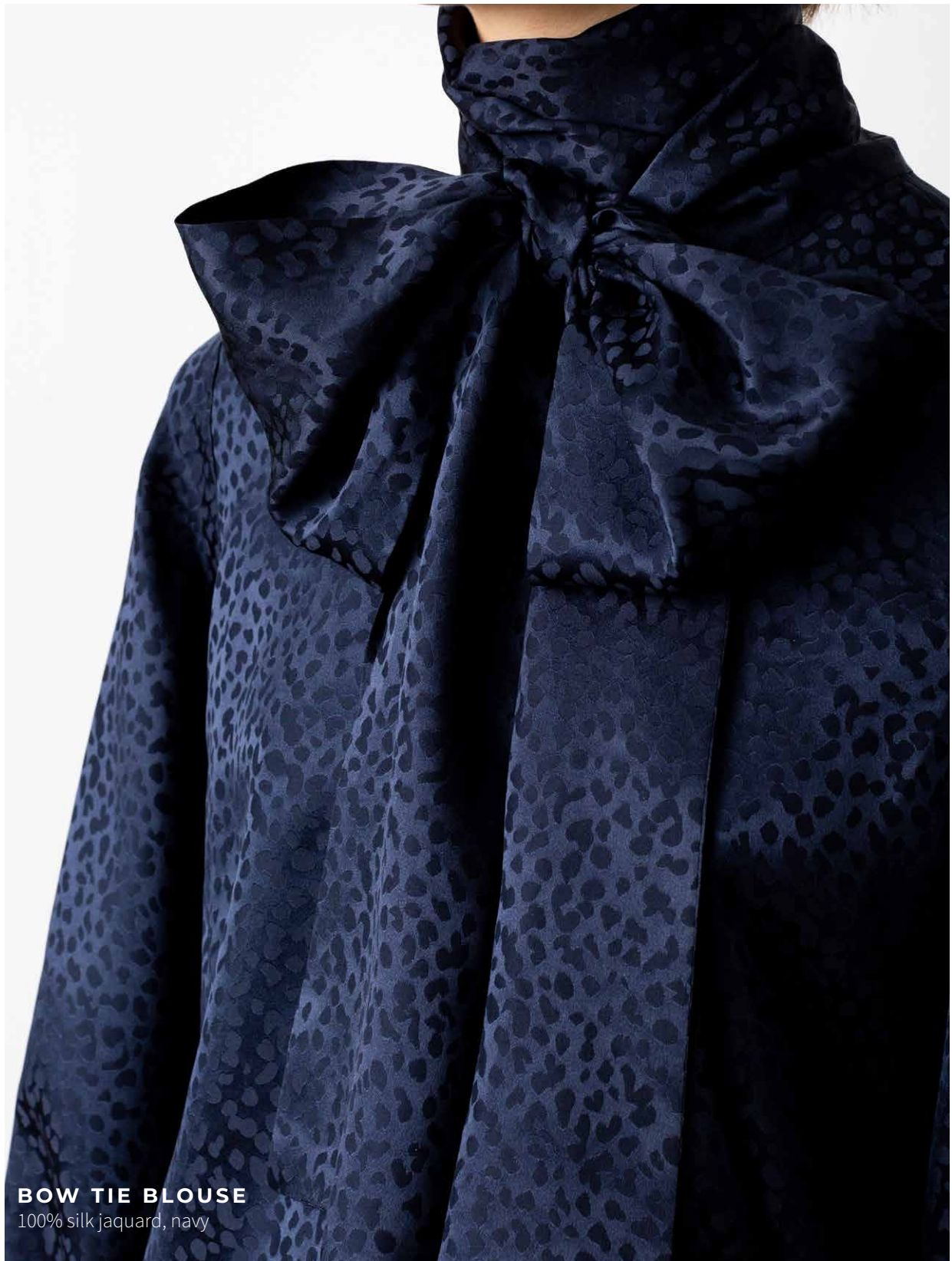
BOW TIE BLOUSE 100% silk jacquard, navy