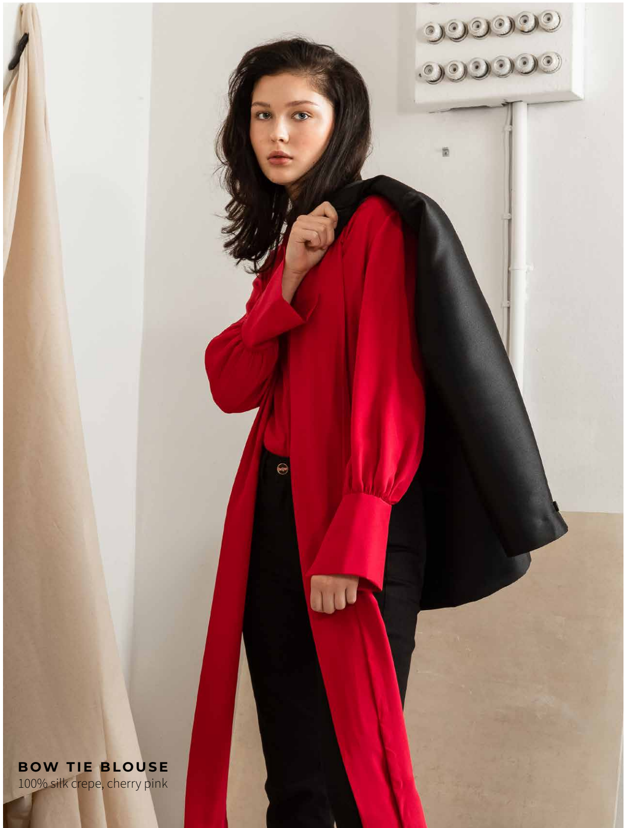
BOW TIE BLOUSE 100% silk crepe, cherry pink