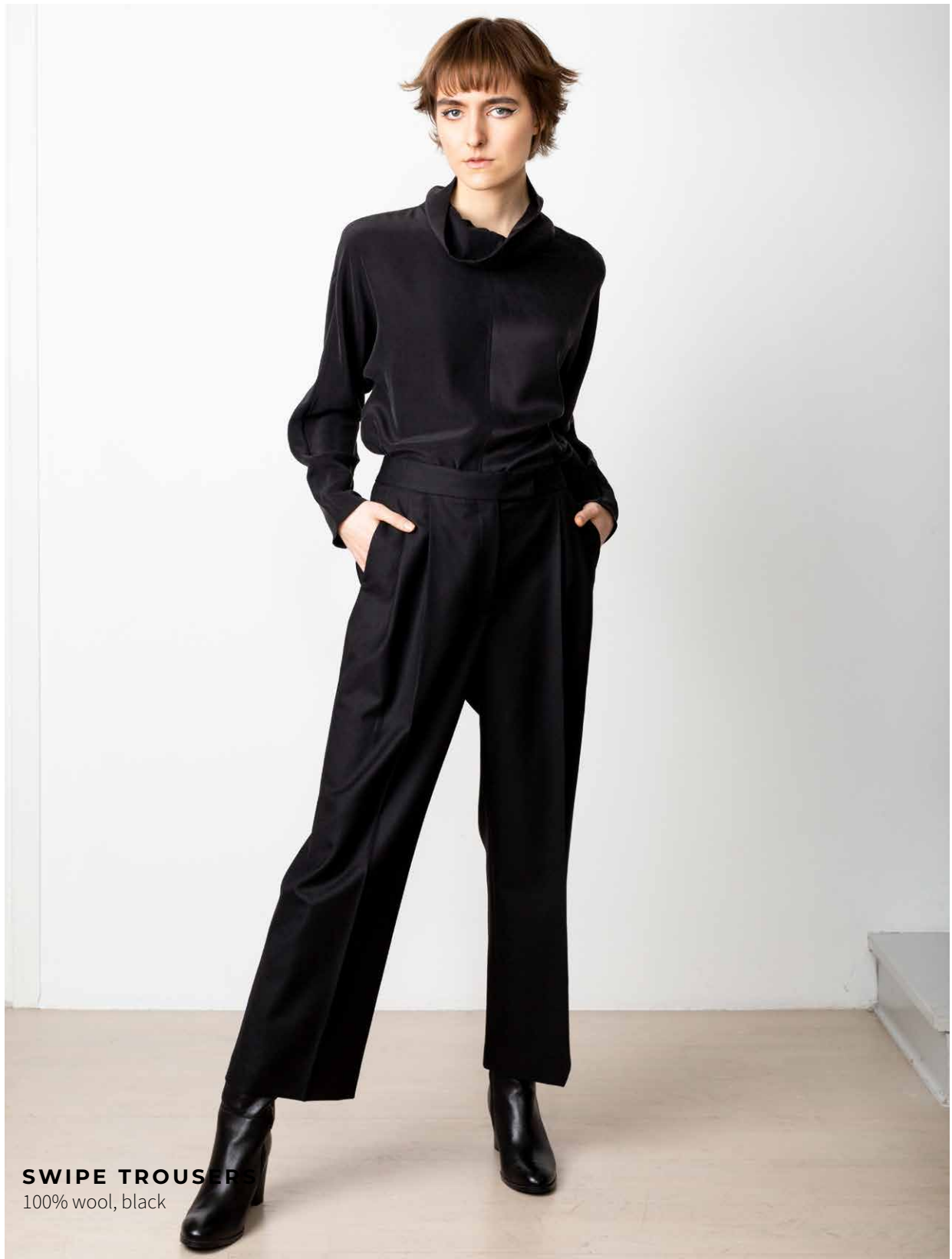
SWIPE TROUSERS 100% wool, black